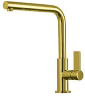
VERONA GOLD R497 G09