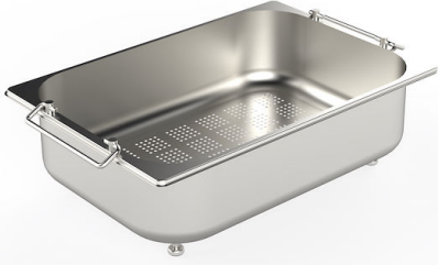
CUVETTE PERFOREE INOX