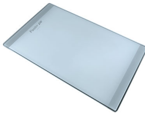
PLANCHE DE DECOUPE CRYSTAL 23x41 CM

* only in combination with the accessory A644 F04