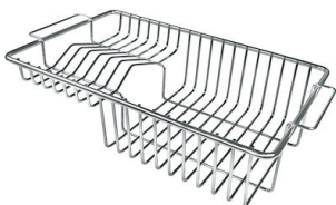
GRILLE PORTE-ASSIETTES INOX 250x425

* only in combination with the accessory A644 A01