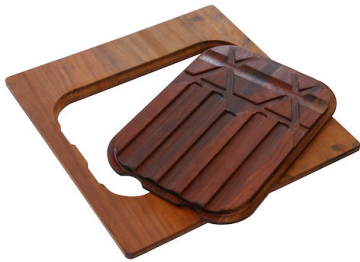
PLANCHE DE DECOUPE DOUBLE IROKO